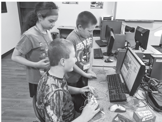
Students learned how to control their Scratch creations with a MakeyMakey.