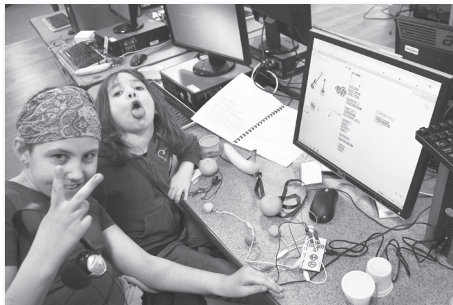
Having fun was required in Family Creative Learning!