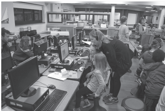
Starting at workshop three, each family worked together to make their own unique creation.