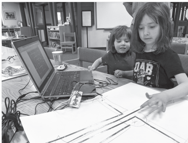
At the end of our workshops, a project showcase gave everyone their ability to try out each family's creation.